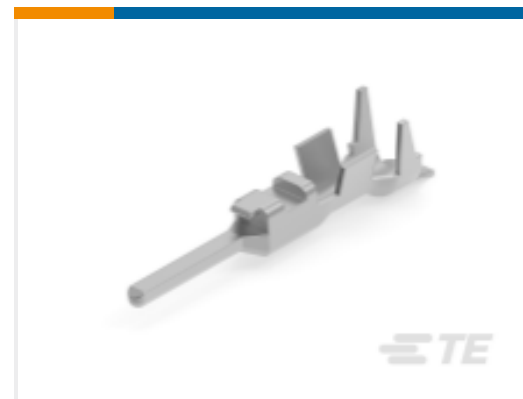
TE Part # 1-2834068-2 PIN CONTACT, MINIATURE WATERPROOF CONN