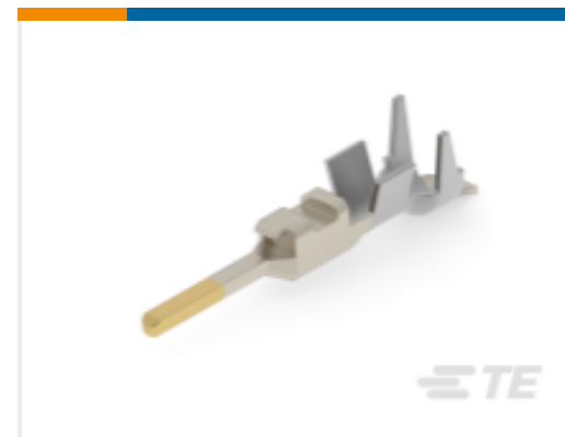
TE Part # 1-2834068-3 PIN CONTACT, MINIATURE WATERPROOF CONN