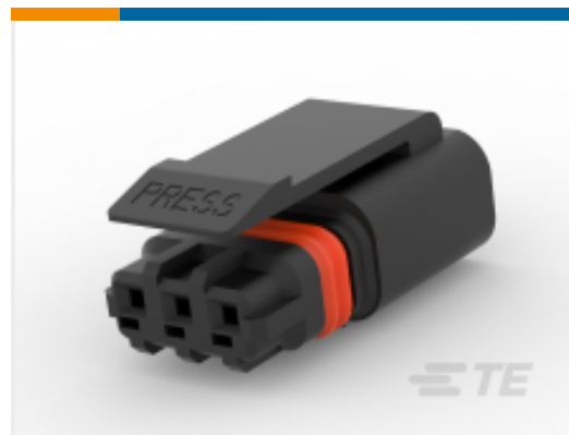
TE Part # 2-2834074-3 3P PLUG, MINIATURE WATERPROOF CONN, BLACK